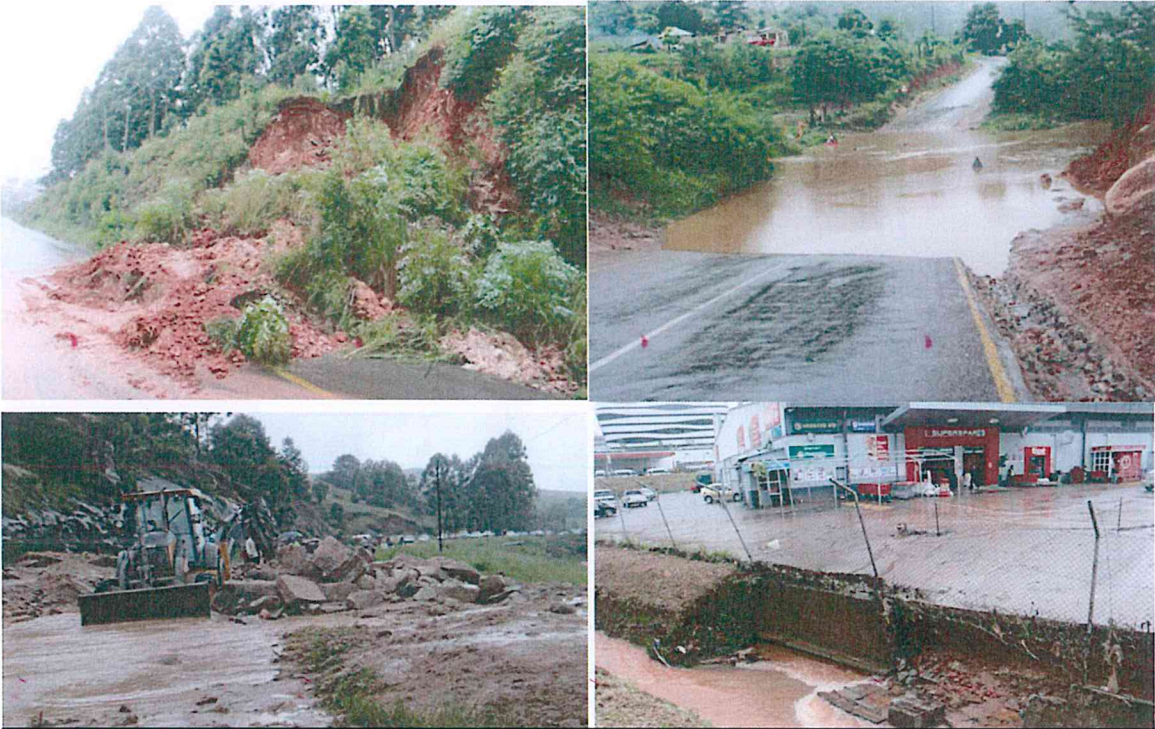
Pictures showing loss and damage due to the extensive rainfall received during the period 23-24 January 2021

A total of 266 houses have been damaged and 1410 persons displaced by the floods and landslides. Different parts of the country received varying amounts of rainfall (high intensities possible) and experience the very strong winds at the passage of the storm coupled with the passing of a cold front. These strong winds have also impacted different locations differently depending on altitude and orientation of the country mountains.